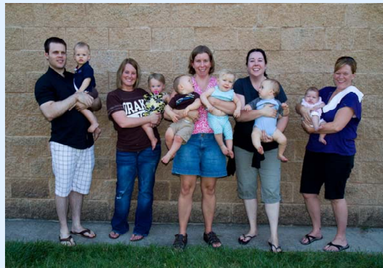
From IASB family picnic September 11, 2011.